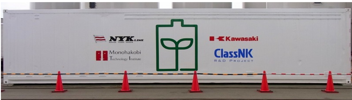
40-foot container in which inverters, transformers and other devices are installed.