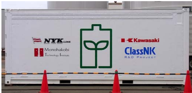
20-foot container in which 16 sets of Gigacell®, control panels and other devices are installed.