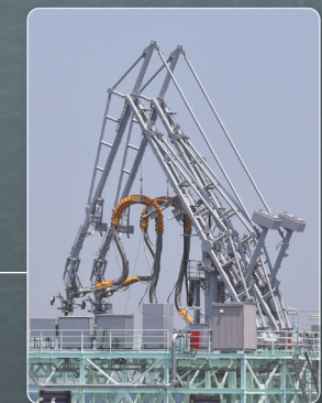
World's first liquefied hydrogen loading system