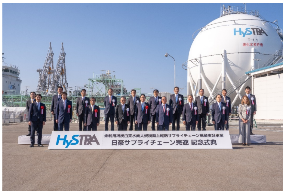
Ceremony for completing the demonstration test

The HySTRA ※1 joint venture, comprising Iwatani Corporation, Kawasaki Heavy Industries, Ltd., Shell Japan Ltd., Electric Power Development Co., Ltd.(J-POWER), Marubeni Corporation, ENEOS Corporation, and Kawasaki Kisen Kaisha, Ltd. with support from NEDO ※2 , is exploring the development of a large-scale marine transport supply chain.