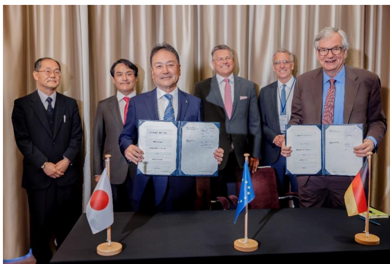
Signing ceremony in Berlin